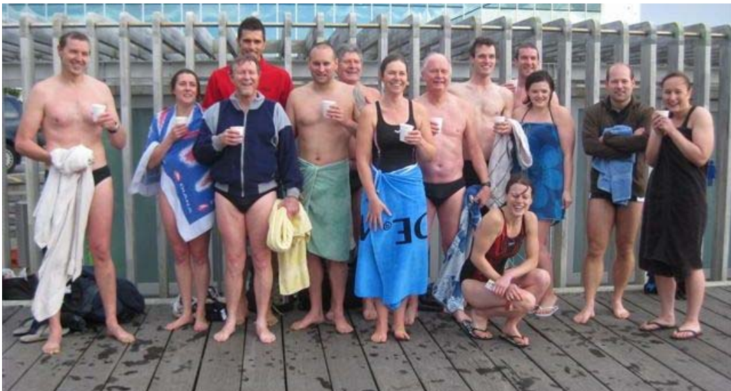
The hardest of HCM